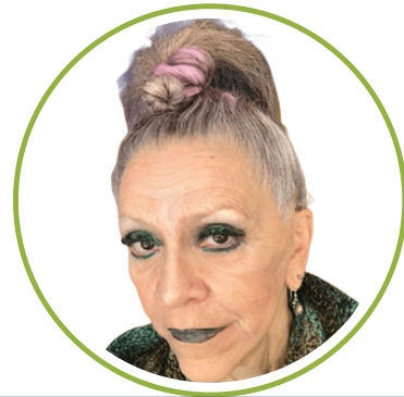
Global Expert in Curriculum Design and CPD

Dean Emeritus, Faculty of Health Sciences, Queen's University, Canada Former President, Royal College of Physicians & Surgeons of Canada. Internationally recognized leader in surgical education and health-professions training reform. Officer of the Order of Canada, one of the nation's highest civilian honors.