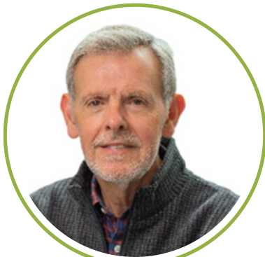
International Expert in Reflective Practice